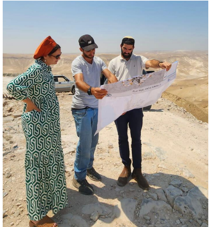
August, 2023 — Regavim and the Gush Etzion Land Division hosted a field tour for MK Limor Son Har-Melech. The tour focused on the 'illegal Arab takeover' of land and a particular focus on the Beit Fajjar quarry.

In 2020, Regavim lobbied the defense establishment and the Civil Administration to modify the land registration process in the West Bank, thereby streamlining land acquisition for Israeli settlers. A significant triumph for Regavim materialized in February of 2022, as they compelled the Israeli High Court to grant the Israeli Ministry of Defense a 60-day window to provide justifications for the proscription on Israeli citizens purchasing land in the West Bank 85 , which is formally under military occupation by Israel. This effort, understood in conjunction with Regavim's sustained efforts to destroy existing Palestinian villages, their infrastructure, and ultimately forcibly displace entire communities, supports a racist and colonial endeavor by which one group of people