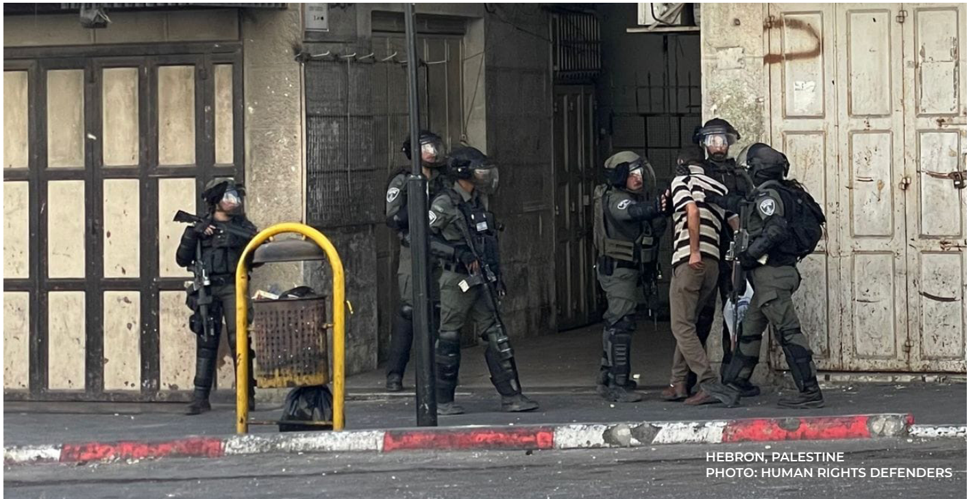
HEBRON, PALESTINE

exacerbates violence but also accelerates the erasure of indigenous communities. As this report will illustrate, organizations such as Regavim utilize these resources to expand their workforce, recruit volunteers and tourists, build relationships with Israeli politicians, law enforcement officials and bureaucrats, advance their leadership's political careers, invite meetings and tours with foreign diplomats and politicians, actively lobby against policies intended to alleviate socio-economic disparities, and disseminate racist and colonial propaganda.