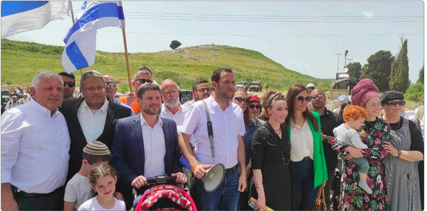
Israeli MKs were photographed today in Homesh, an Israeli outpost near Burqa, north of Nablus. MK Silman was seen alongside Bezael Smotrich, co-founder of Regavim and Itamar Ben Gvir, linked to the Israel Land Fund.