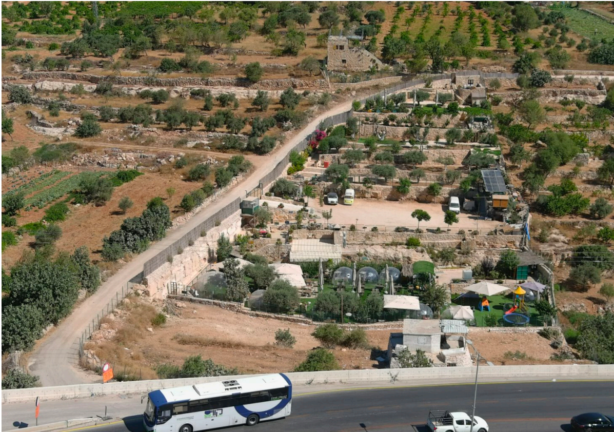
An aerial image was taken of a Palestinian restaurant in Bethlehem, which Regavim is currently advocating for destruction. Surveillance is part of Regavim's drone project, a unit within Regavim that deploys drones to surveil Palestinian communities.

communities. In general, Regavim uses the information it gathers through surveillance to entrench and expand its network of influence at the very tangible and personal detriment of Palestinian communities.