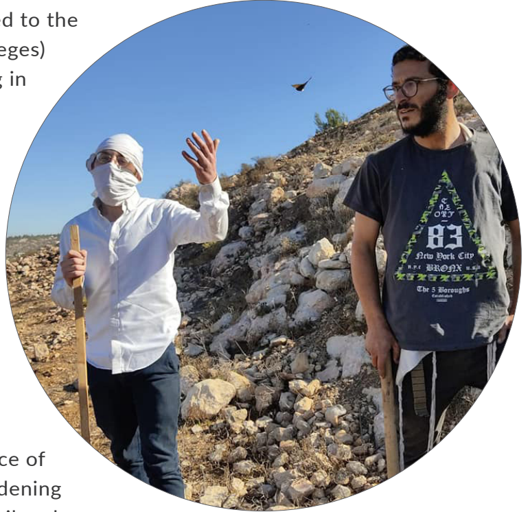
Israeli settler attack in Masafer Yatta

In executing its colonial vision, Regavim divides its work into three distinct arenas described on its website: field work, research, and legal divisions. 23 Its field work involves engaging in invasive and aggressive surveillance of Palestinian villages and individuals and emboldening settlers to infringe on Palestinian property, civil and human rights. This includes the use of drones to fly over and surveil private Palestinian property with no prior consent by the landowners. 24 Using the data collected from its surveillance activities, Regavim produces and publishes misrepresentative, and often openly unfactual, reports that wrongfully portray indigenous Palestinians as settlers in their own homes and lands. These reports are then used to support lawfare campaigns