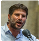
Bezalel Smotrich Cofounder of Regavim